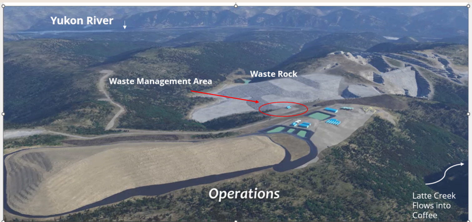
Coffee Gold Mine Project - Waste Management Area

Over the last two years, WRFN Environment Committee Representatives have been working with Newmont on minimizing harmful products to be buried in WRFN territory. Most harmful materials have been removed. The following are still being discussed: Treated wood, Gypsum, Scrap Metal, Microplastics, Ash (from the incinerator)