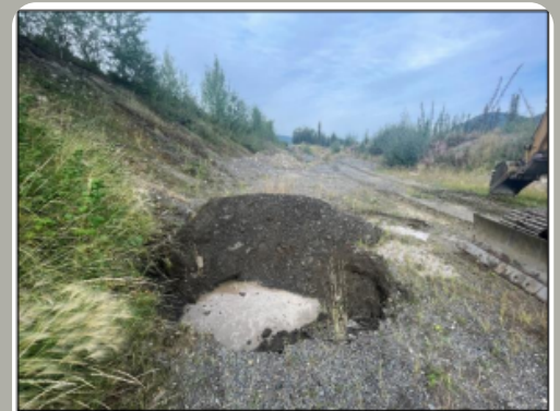
Figure 1 TP23-01 Excavation

The photos above show where the exploration landfill has come into contact with groundwater.